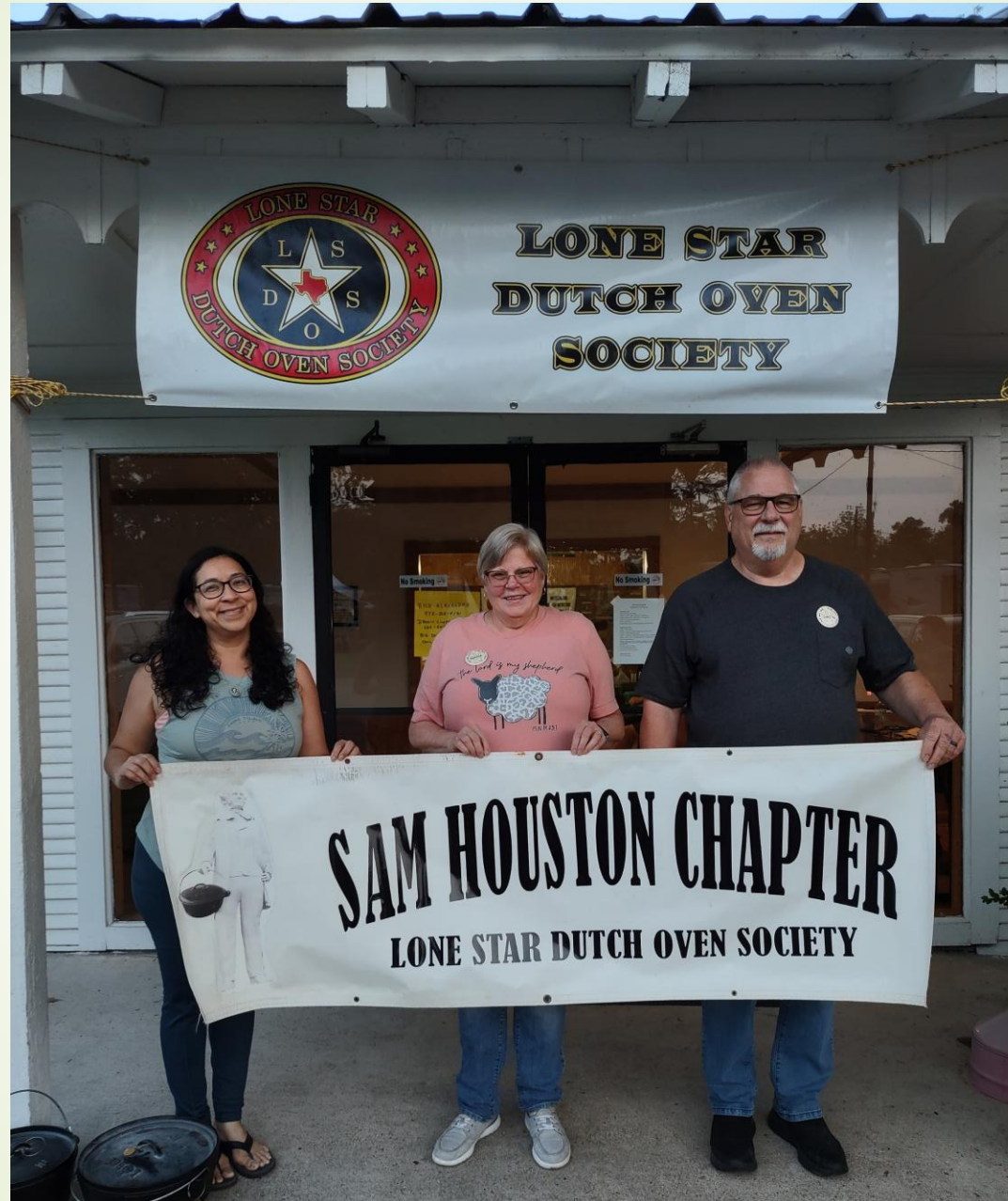
Sam Houston Chapter