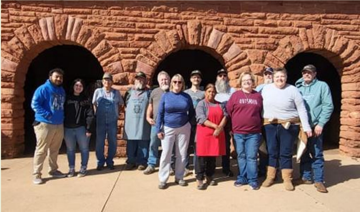
Big Country Dutch Oven Group