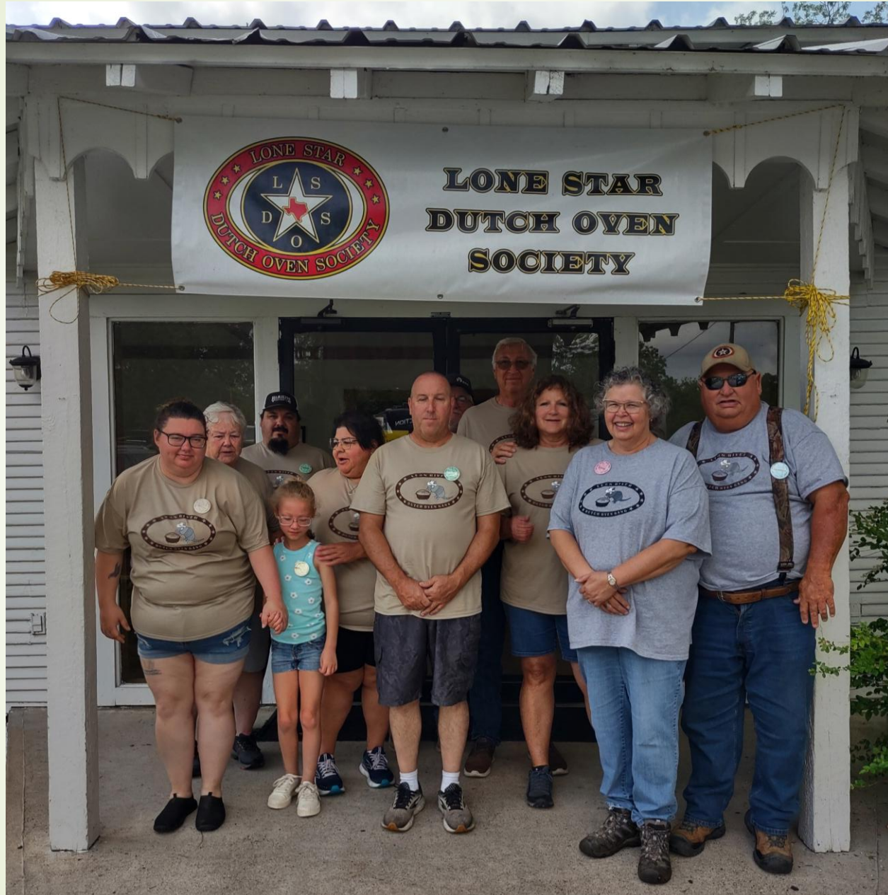
Leon Valley Dutch Oven Gang